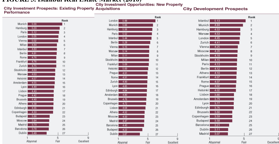
FIGURE 3. İstanbul Real Estate Market (2010)

In the report Emerging Trends in Real Estate Europe 2010, ULI and PwC (2010: 9, 35) ranked İstanbul third for investment prospects and first for development. On the other hand, according to existing property performance and new property opportunities, İstanbul seems to be one of the leading markets.